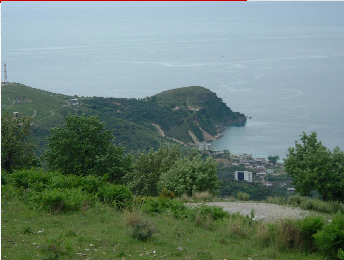
FP-6 Dissemination Activity Albania