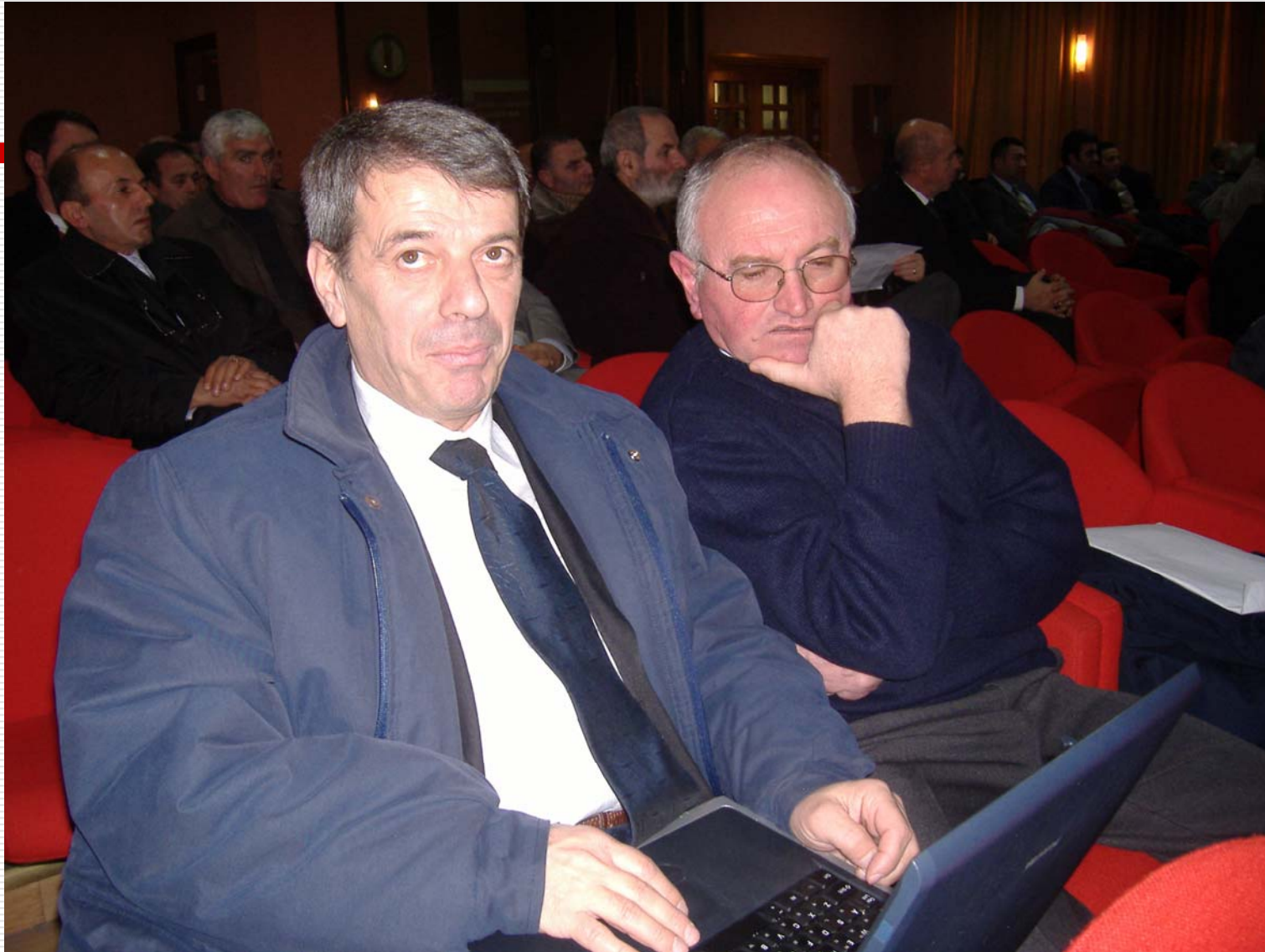
FP-6 Dissemination Activity Albania