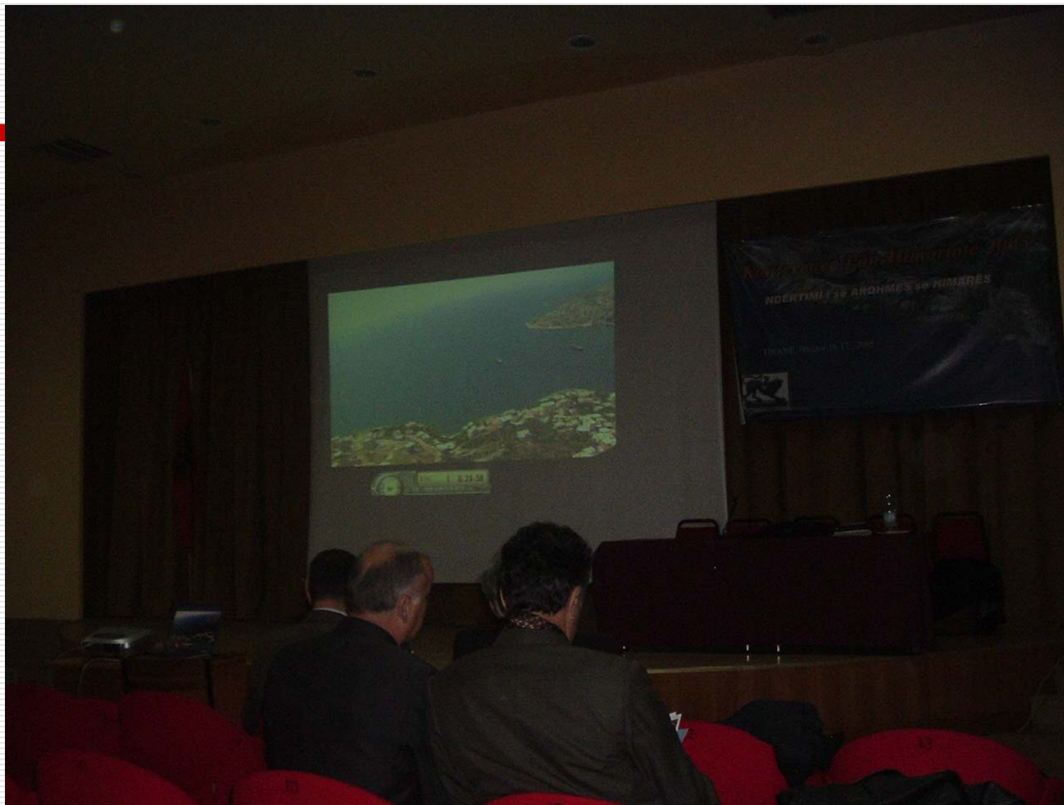
FP-6 Dissemination Activity Albania