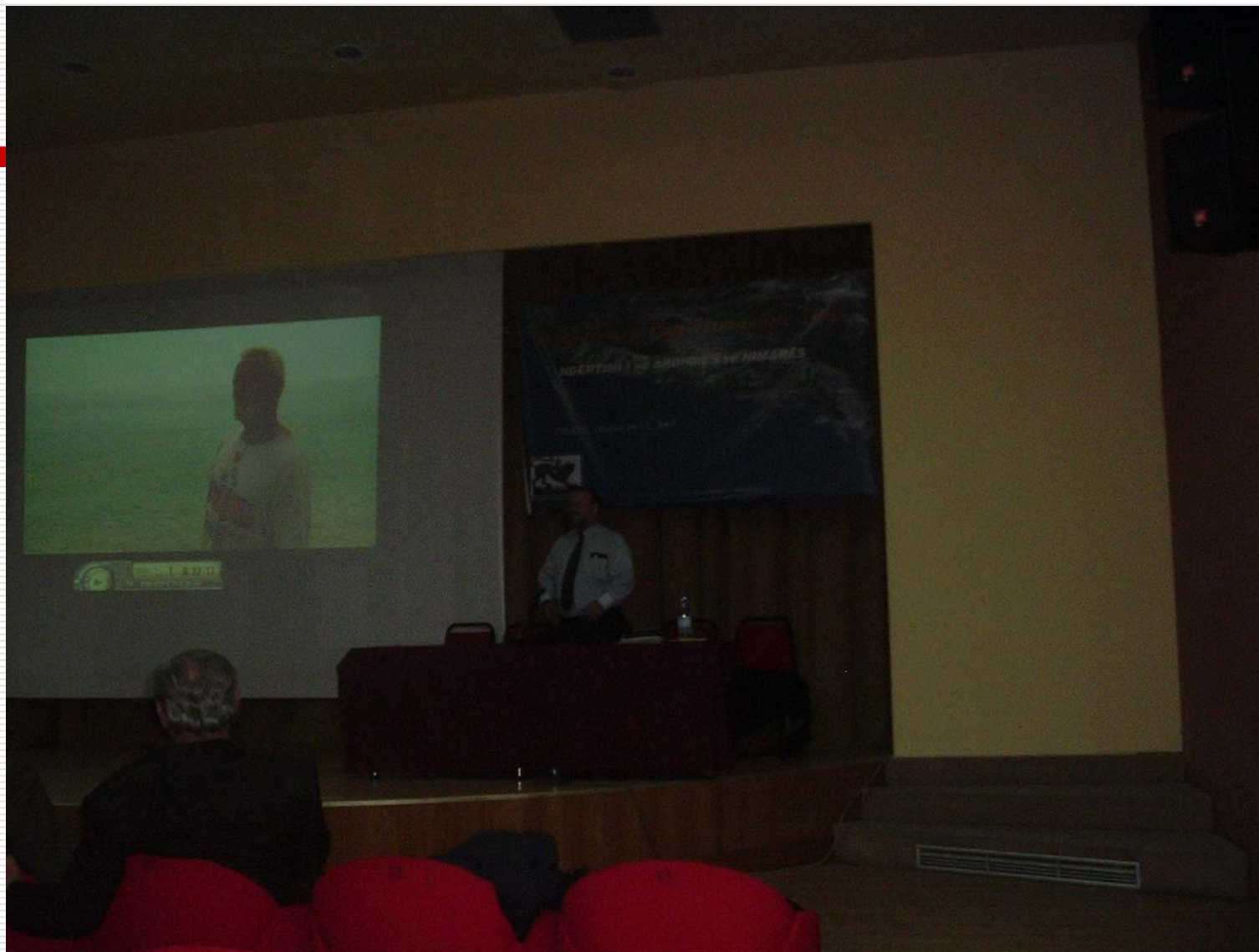
FP-6 Dissemination Activity Albania