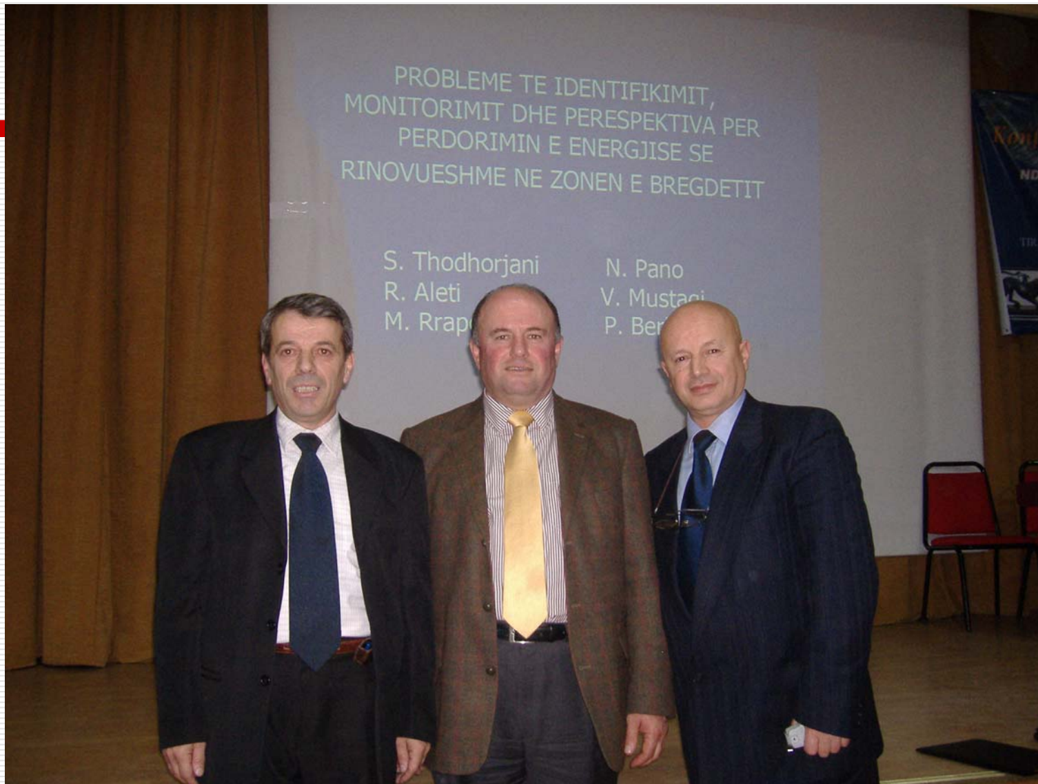
FP-6 Dissemination Activity Albania