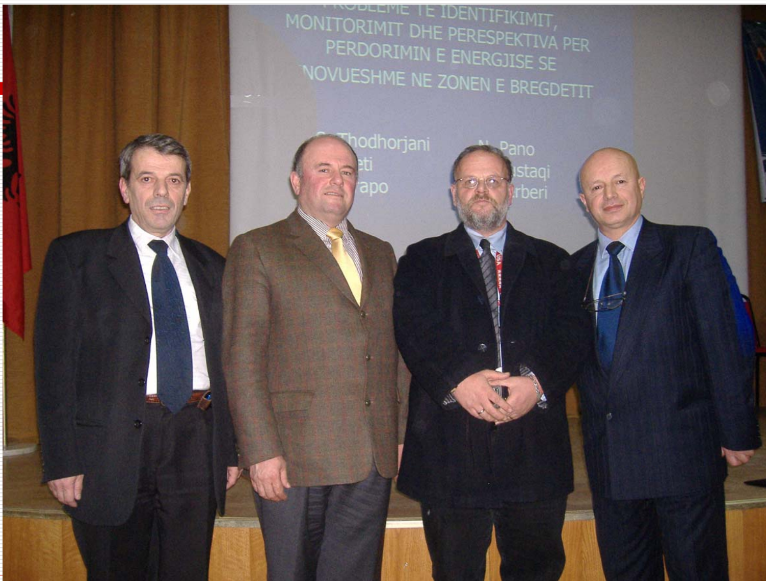
FP-6 Dissemination Activity Albania