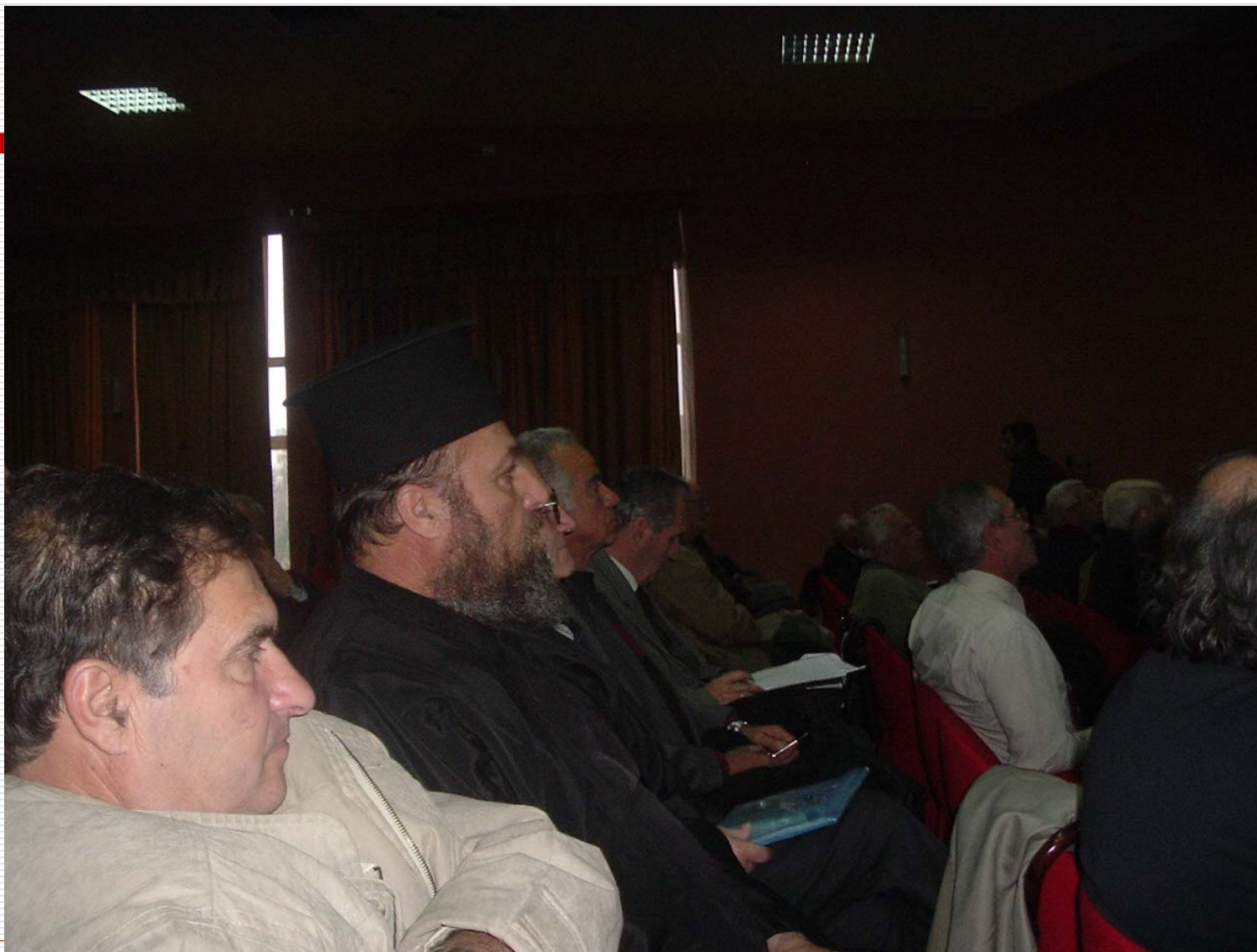
FP-6 Dissemination Activity Albania